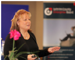
Improvement Through Change Conference