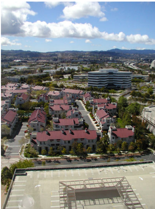
Figure 1: Sprawl created the suburban town Foster City

Moreover, different approaches to growth management can be noticed over time; ranging from containment (limit lines), to inner city approaches (infill and transit orientation) to regional development (Livability Footprint Project - Association of Bay Area Governments, 2002). Growth management was also following changing patterns in the location of sprawl (see Figure 1), starting in the city of San Francisco and moving to adjacent suburbs to the south and north towards the East Bay.