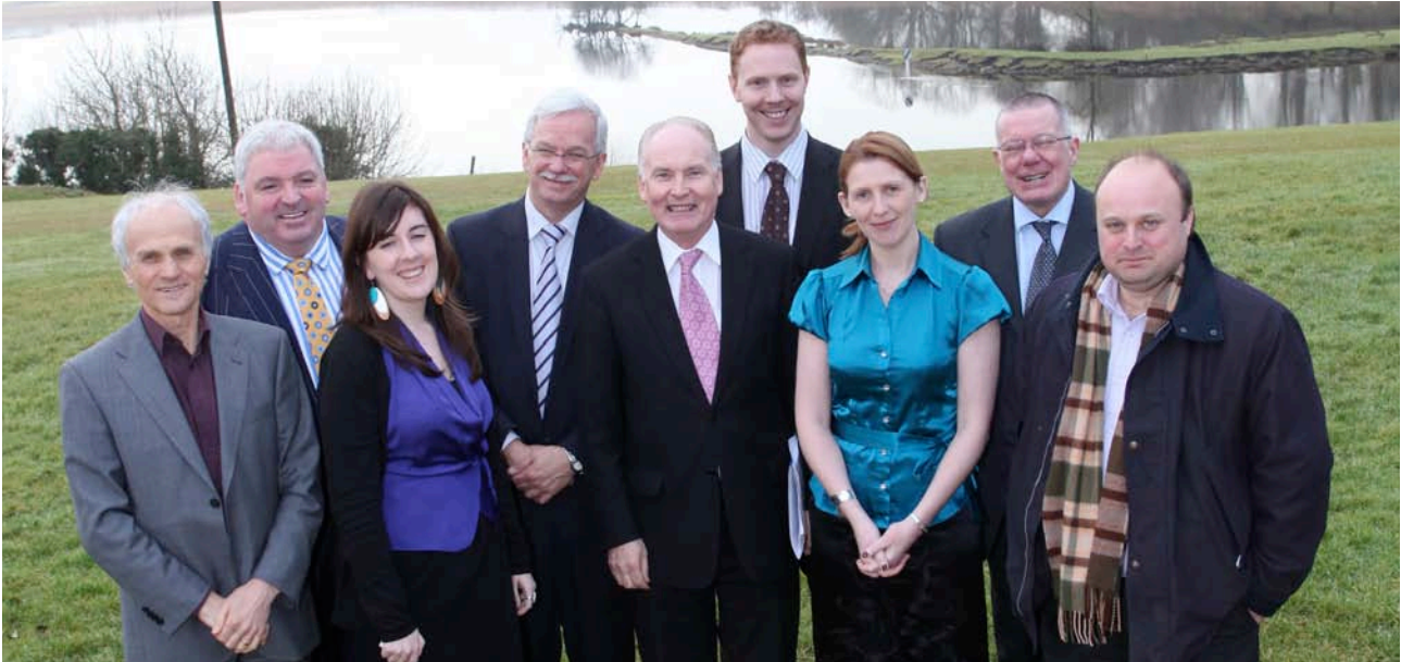
Members of the ICLRD Team at the 2010 Annual Conference in Enniskillen

Cooperation Observatory (INICCO) managed by the Centre for Cross Border Studies. Further information can be found at www.crossborder.ie .