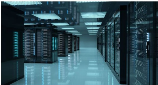
Electricity consumed by data centres in Ireland jumped by 144 per cent between 2015 and 2020, according to new figures from the Central Statistics Office.

Prepared by the Department of the Environment, Climate & Communications gov.ie/decc